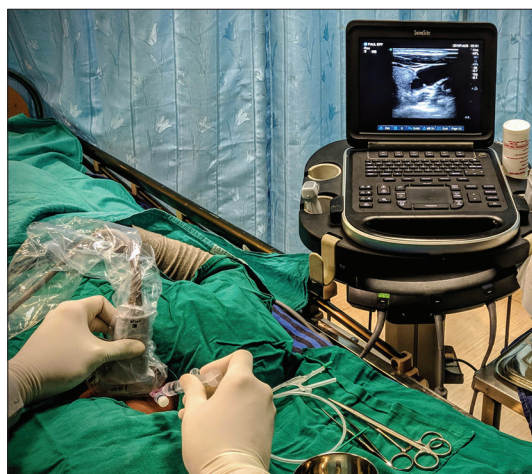
Figure 1: Ultrasound-guided right internal jugular vein central venous catheter insertion in a patient

USG: Ultrasonography, AL: Anatomical landmark